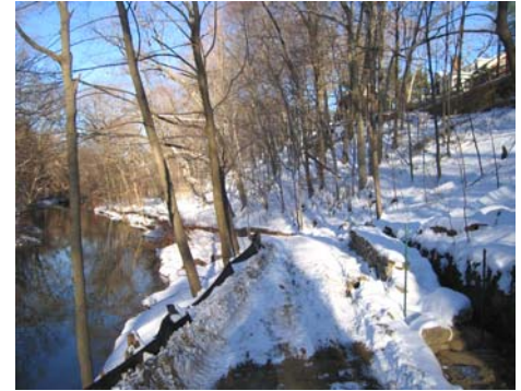
Snow blankets restoration work recently begun on the Bronx River path north of Hitchcock Pond in Scarsdale

opportunities for even more restoration projects as well as furthering the inventory of ongoing projects. This year at the urging of local House Representatives there is $375,000 for the Corps to continue this project. What makes this project so exciting is that these federal resources are matched, dollar-for-dollar, by local funds creating a truly collaborative report. According to Congresswoman Lowey, "while this is certainly not a silver bullet for the Bronx River, it is a step in the right direction and it is a step that can be built upon with future projects."